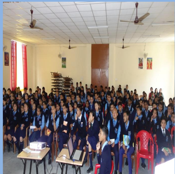
Picture: Audience at Tadong SSS ON 29/03/2016