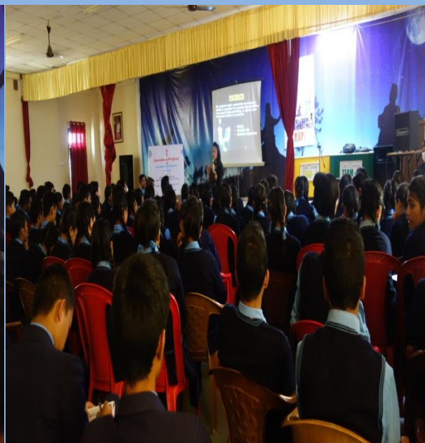
Pictures: Presentation on IPR by Project Scientist, PIC, SSCS&T at Tadong Senior Sec. School on 29/03/2016