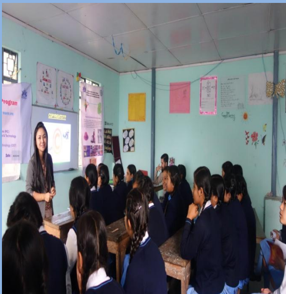
Picture: Interaction with audience (28/03/2016)